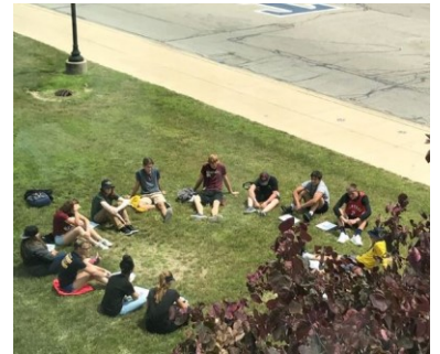
2019 YLDC Delegates