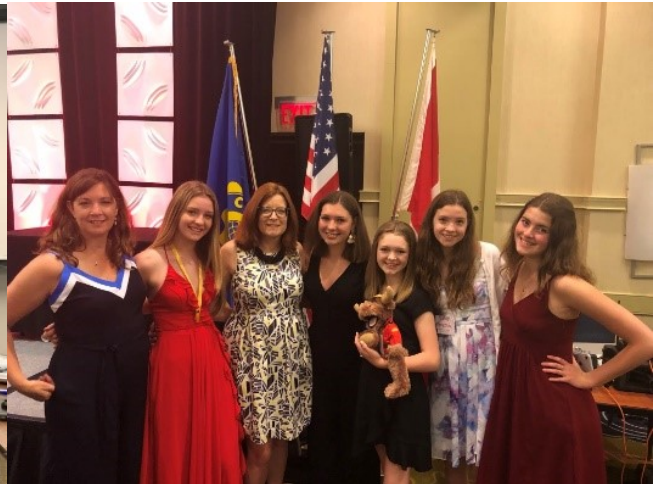
Canadians at International Convention

leadership motivation dedication excellence drive discipline passion heart