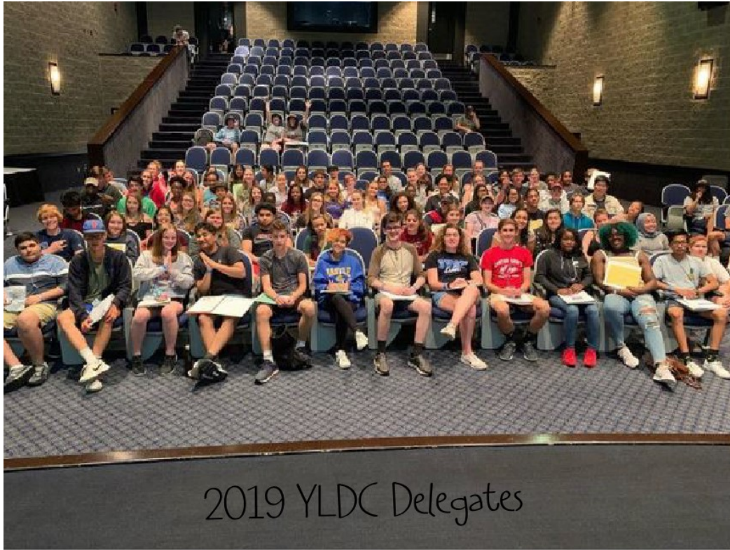
2019 YLDC Delegates

Located at Trine University in Angola, IN, the Civitan Youth Leadership and Diversity Conference (YLDC) has spent one week each summer for 50 years helping the leaders of tomorrow develop the skills to tackle real-world issues within their communities and their world.