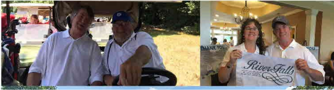
THE CAN-AM TEAM (BELOW)