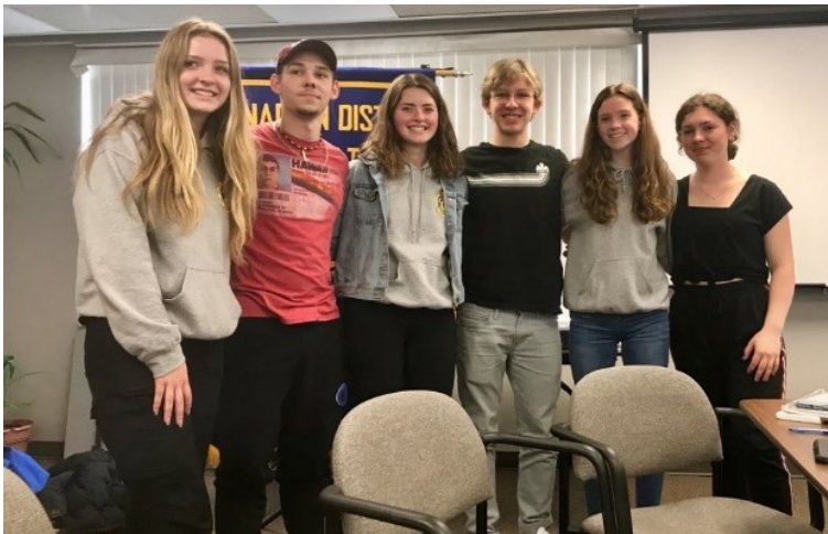
2019-2020 Canadian District West Board