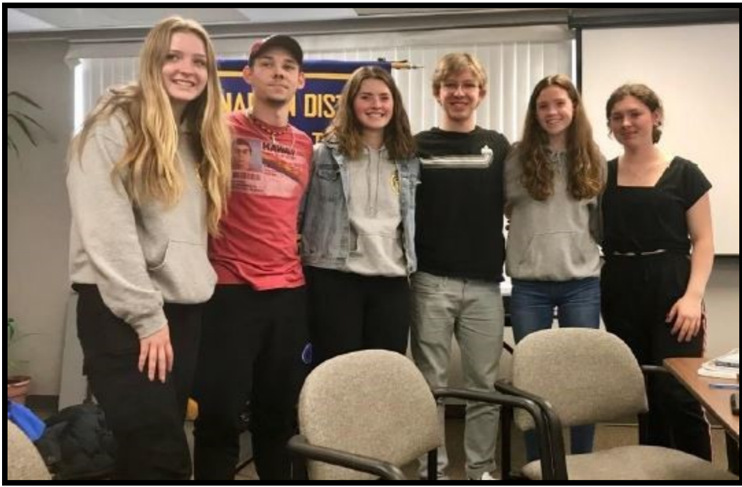
2019-20 Canadian District West Junior Board